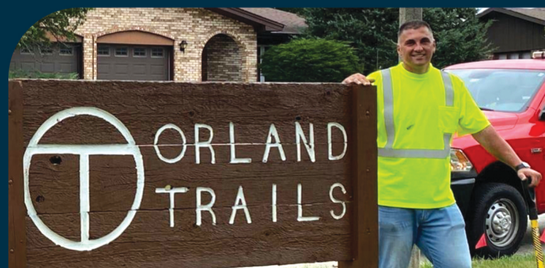
Orland Trails Sign Restoration