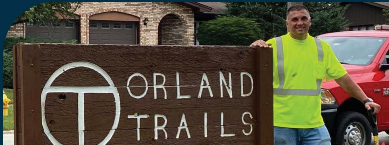
Orland Trails Sign Restoration